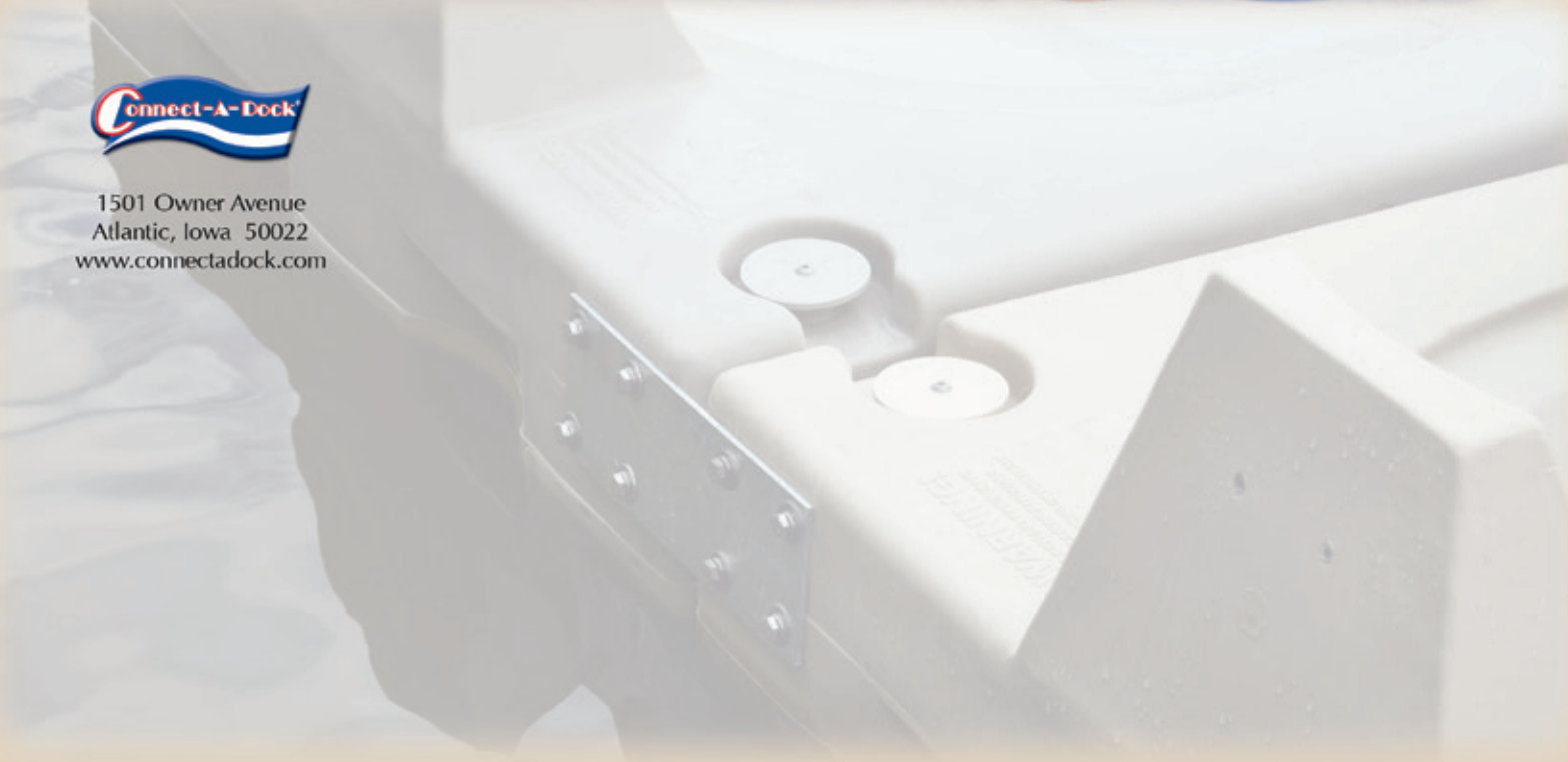
Black (special order)

1501 Owner Avenue Atlantic, Iowa 50022 www.connectadock.com